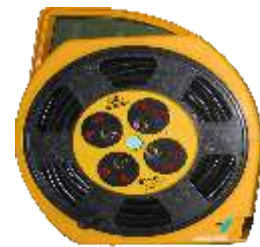
MODEL: SS173 -20M