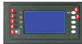
5 inch LCD